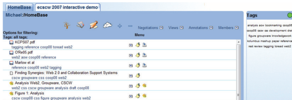
Figure 3: The Tagger plugin

in collaboration support systems (Mathes 2004). Metadata is widely accepted to be the remedy for this problem. However, existing approaches using pre-defined metadata have shown poor user acceptance due to an imbalance of work and benefit (Grudin 1988), and usually result in trivial descriptions (Heath et al. 2005). Other approaches use formal semantics such as ontologies. While these mechanisms describe content properly, they impose an additional cognitive effort on users and may therefore not provide a solution to the problem (Golder & Huberman 2006, Grudin 2006).